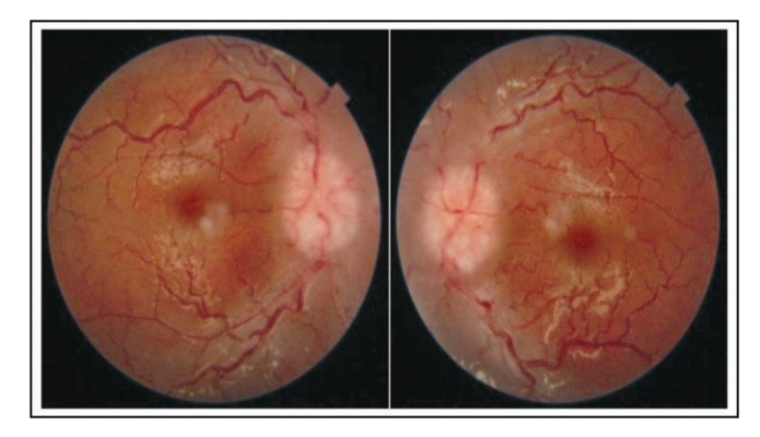
Fig. 2: Fundus photographs showing papilledema.

and café-au-lait macules. Hypo-melanotic macules are at least 5mm in size and typically appear at birth or in infancy on limbs, trunk or scalp. Adenoma sebaceum appear between two and five years as fibro-angiomatous red papules in a butter fly distribution around nose and cheeks. Shagreen patch is an area of diffuse thickening over lumbar region having an orange peel appearance that usually appears in first decade of life. Fibrous cephalic plaques can be seen on forehead as well as face in about 25%. Subungual and